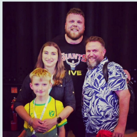
The whole family meeting 3 times World's Strongest Man (he's very tall!)