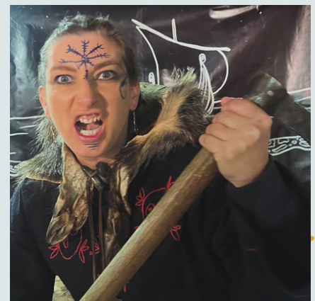
In role as a viking warrior