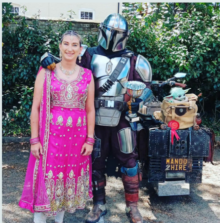
In full Bollywood costume meeting the Mandalorian at Beccles Carnival